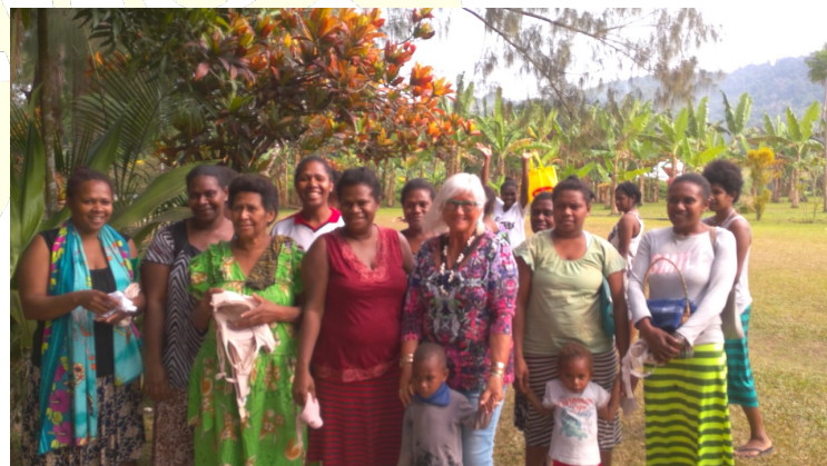
From our family to yours...