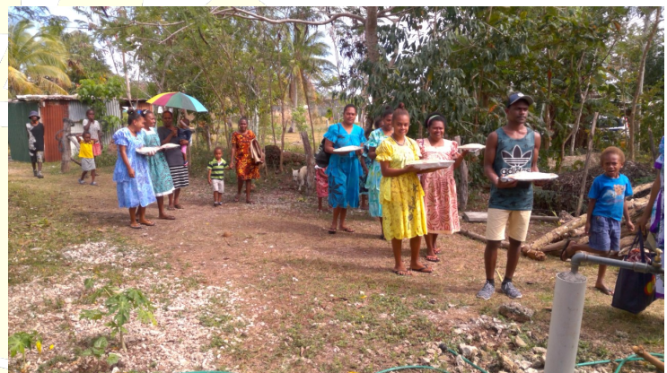
Let the feast begin!