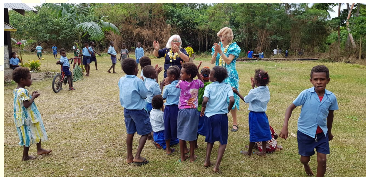
Heads, shoulders, knees and toes...