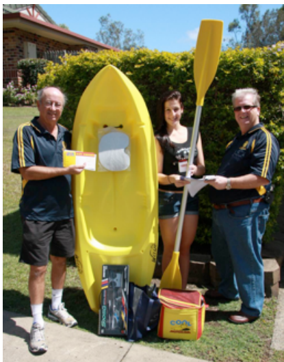
There have been raffles