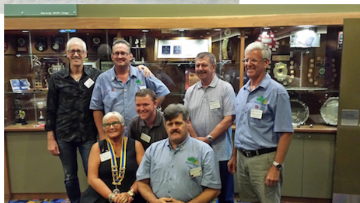
And so we have the new leadership team to lead us forward...