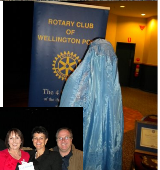
Clair Danes presents her story of a trip to Afghanistan and introduces us to the Burkah