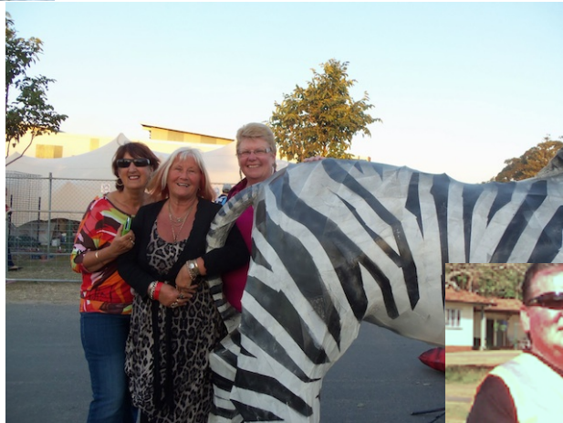
We have had lots of fun and taken silly pictures