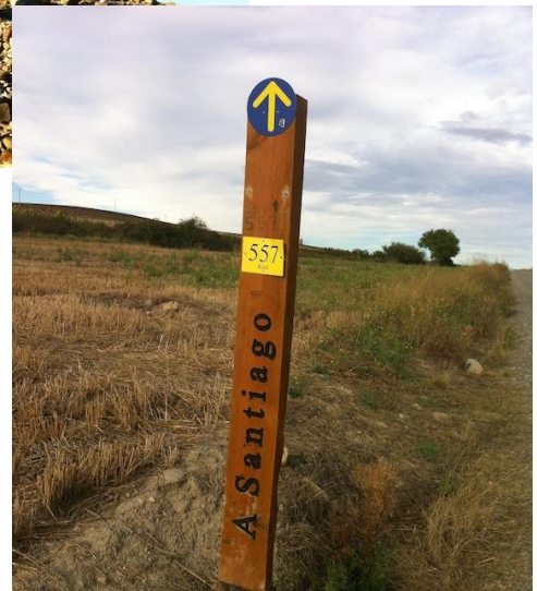
Marker Post – and still a long way to walk!