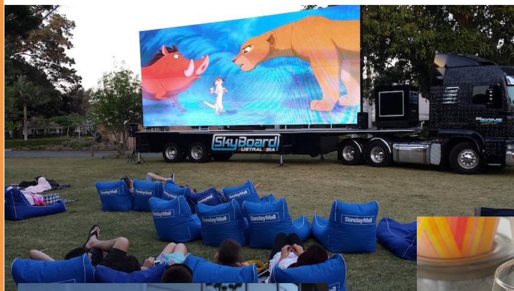
Fund Raiser at Ormiston College for African Hearts