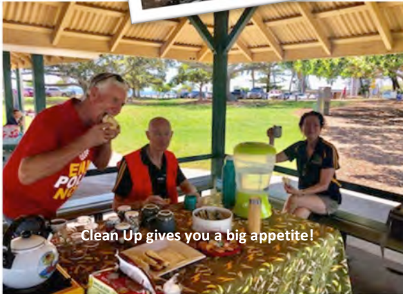
Clean Up gives you a big appetite!