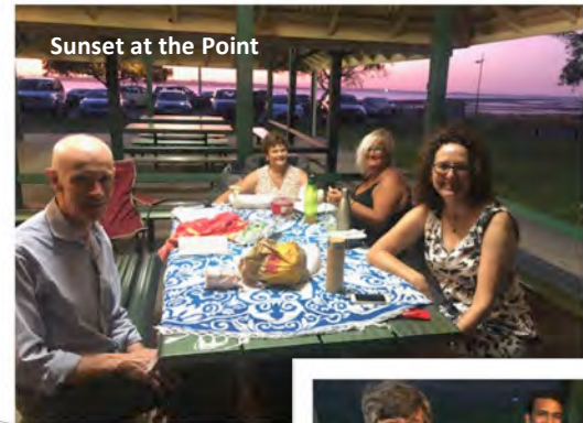
Sunset at the Point

Thank you to all of our members and Friends of Rotary who attended our most recent Member's Choice Social event on the 29th January. It was wonderful to share some fish and chips at the Point whilst engaging in some special fellowship with one another. We would love to have more frequent socials throughout the year, so if you have any suggestions or ideas for these, feel free to share them. Interestingly, I have since learnt the important life lesson of eating my paddle pop quickly before it melts off!