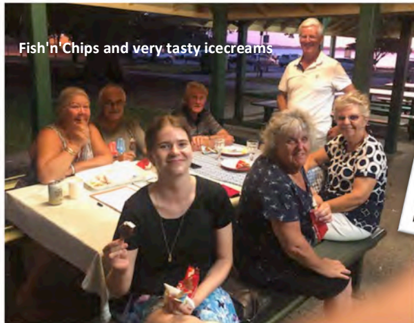
Fish'n' Chips and very tasty icecreams