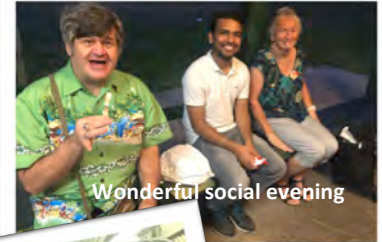
Wonderful social evening