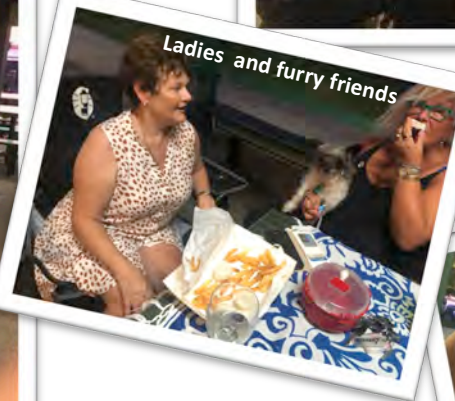
Ladies and furry friends