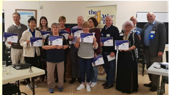
Interclub Debate Night 2019 (Rotary Clubs of Wellington Point, Capalaba and Cleveland).

We've had a Bunnings BBQ - and there is always such a willingness to support these valuable fun(d)raising events - I know the world is always a better place after we've had so many global conversations, all cooked by the warmth of the BBQ!