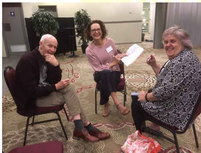
Dogs are better than cats...or are they?

The debates were fun - people stepped out of their comfort zones in a respectful environment and whilst we may not have been the winners of the debate, I feel as a Club, we were the winners for creating a platform for some very engaging Rotary fun and friendships.