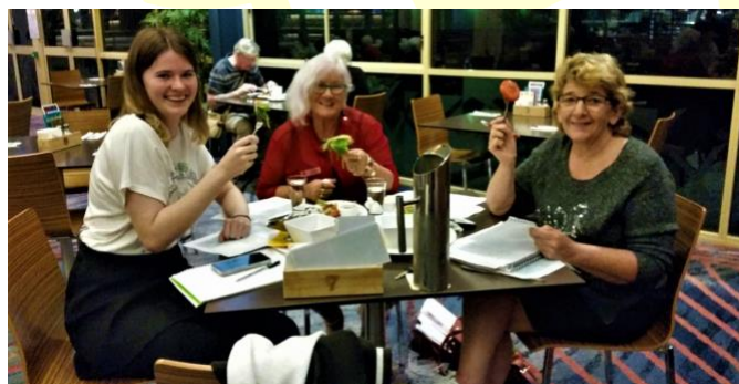
Are we eating to live or living to eat?

Eastern Forum is on the 9th June and I know we are all going to enjoy this forum on Sunday out at Wacol.