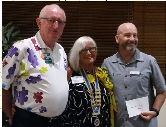
RC of Wellington Point's partnership with Crimestoppers and QPL.

The donation of $2500 to each of these organizations (Queensland Police Legacy) and (Bayside branch of Crimestoppers) was a pleasure - all brought about by the Christmas present wrapping service provided at Capalaba Central Shopping Centre. Capalaba Central Shopping Centre provided the enabling for the training, the materials, and the location - without them, it would not be possible. All the more reason to support locally!