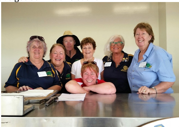
Smiles all round.