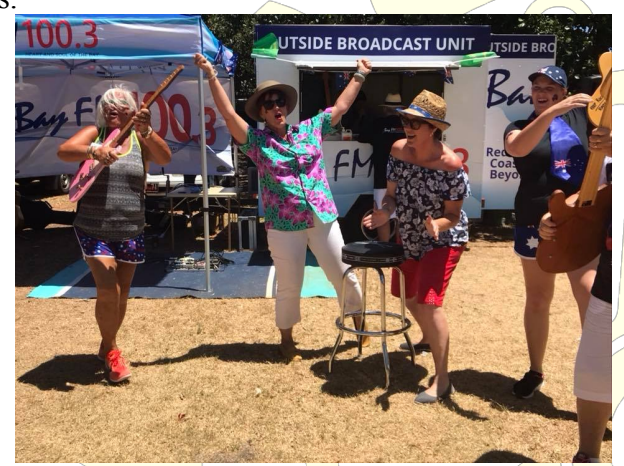
Rock and rollin' baby.

So - as you will see - come and make sure that you are playing an active part in the lives of our Rotary Wellington Point family - and if you have an idea where we can make a difference or even 'be an inspiration', please don't be afraid to share it with us.