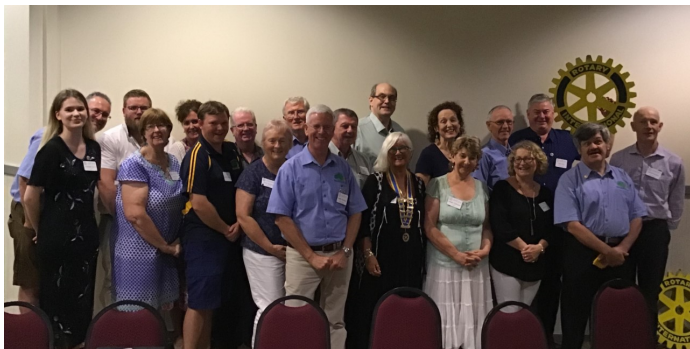
This pic is going straight to the Pool Room.