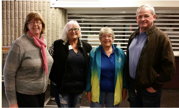
May we all stay safe!

thoroughly enjoyed guiding the respectful students through the different scenarios.