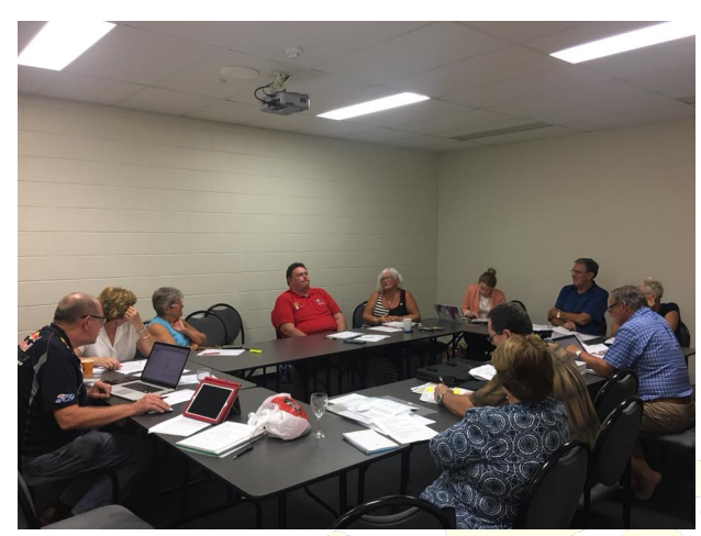
The bee hive of Conference planning