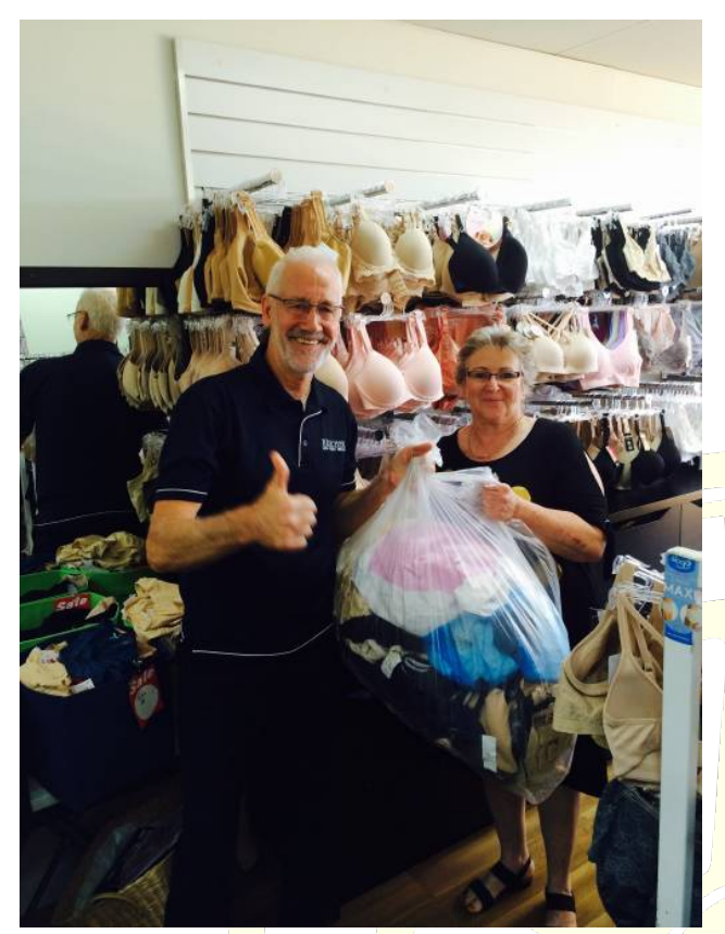
Thanks for the 'support'.