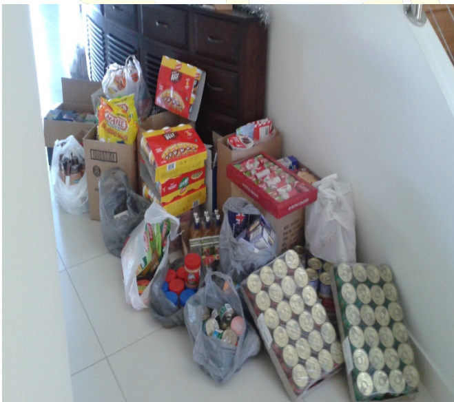
Food purchased by WPRC for Night Ninja's Christmas hampers.