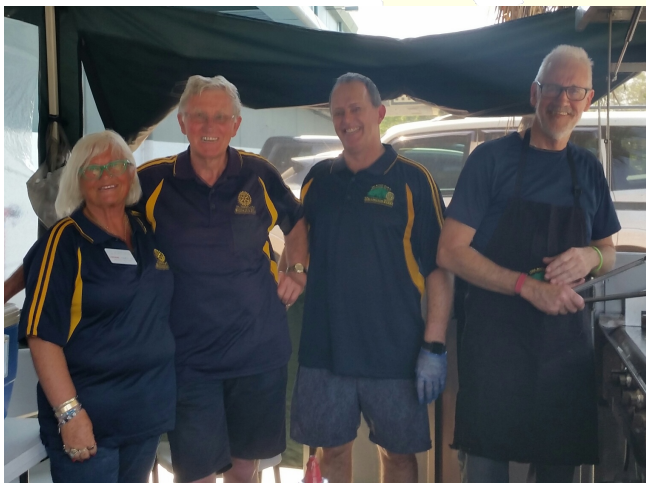
Up and coming MasterChef contestants – specialising in sausage sizzles.