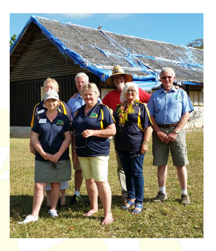
Our Rotarians out and about in Vanuatu