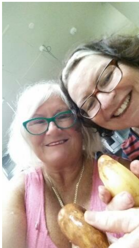
Fun with Potatoes