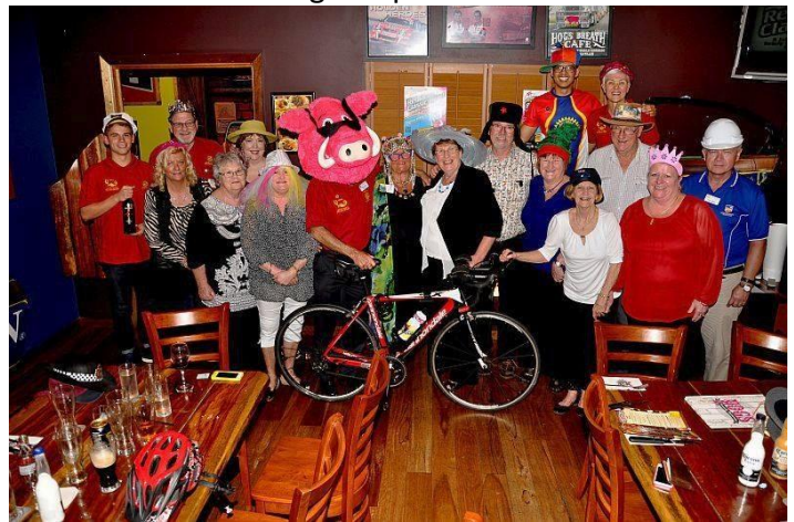
Cycle Ride Collection of hats