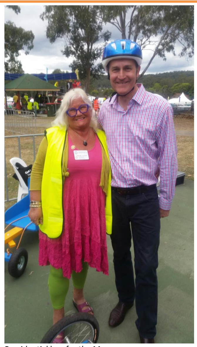
Presidential hug for the Mayor