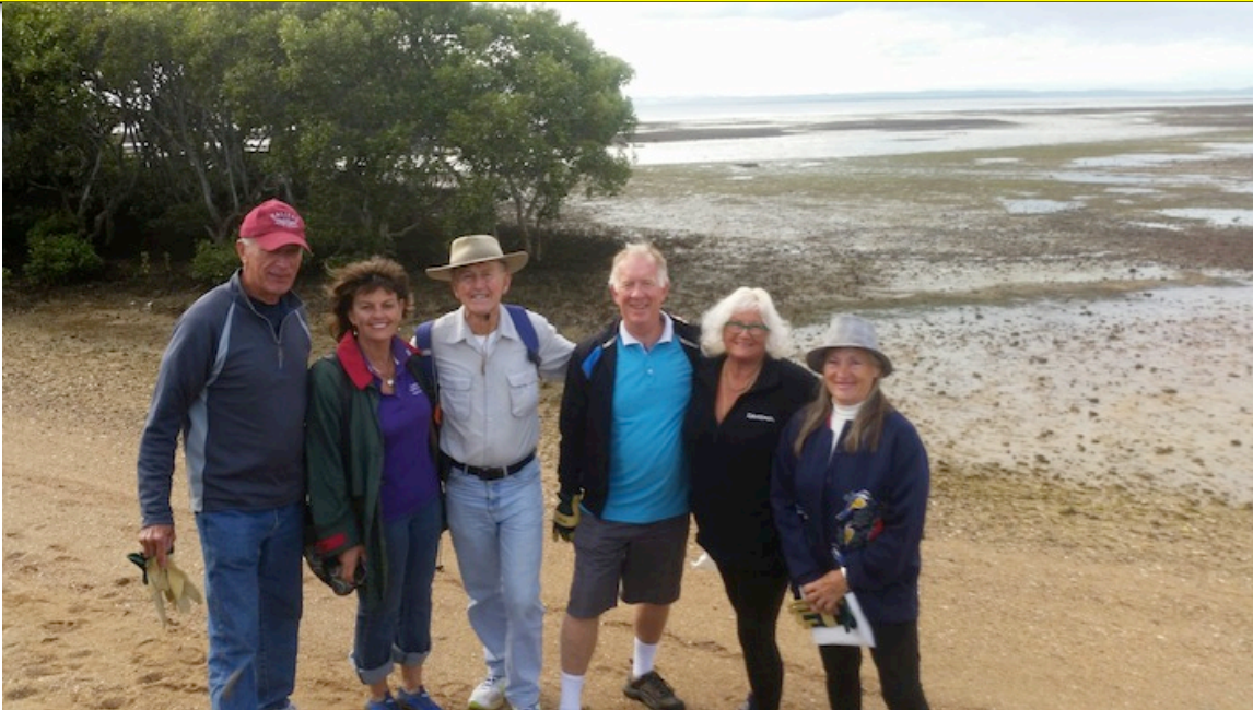
Friends of King Island assembled for another working-bee.