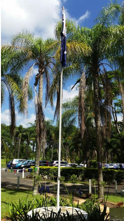
Photos from the Calisto Australia Day Event