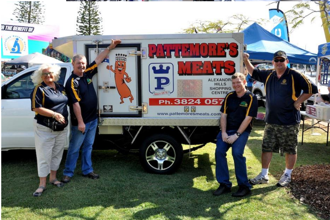
Large sized meat lovers to go!