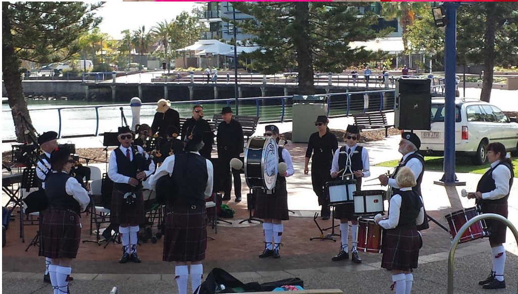
The Scottish Pipe Band sponsored by the Redlands Sporting Club